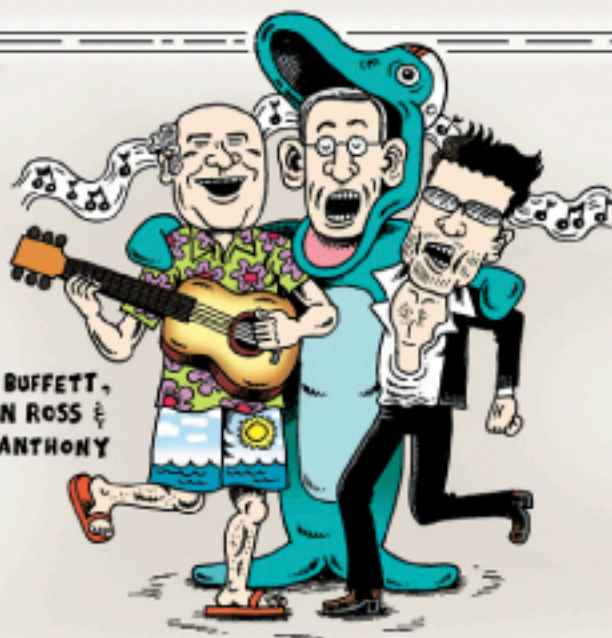
JIMMY BUFFETT, STEPHEN ROSS & MARC ANTHONY